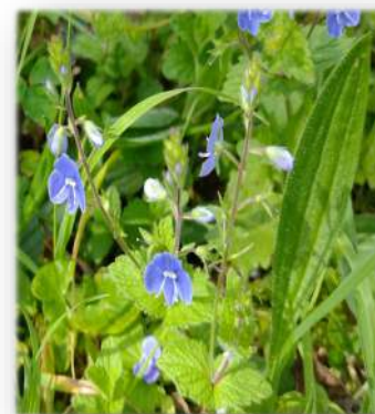
Speedwell, widespread in the Living Churchyard

I am sure that there is more that we can do, and will do, but in the meantime let's celebrate what we have achieved, not from a place of pride, but from the recognition that we are taking seriously the demands of Christian Eco Mission and Discipleship.